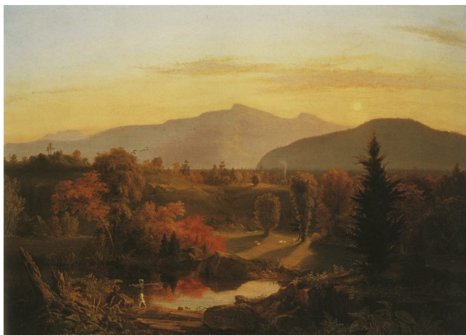
View Near Catskill, 1828-29, P.C.

Cole explores the Catskill Creek landscapes in a series which he created again and again from 1827 to 1845—virtually the whole course of his mature career.