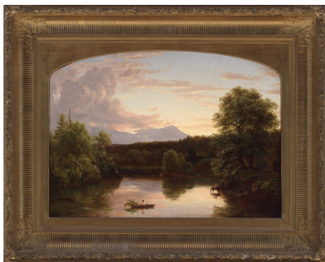
North Mountain and Catskill Creek 1838, Yale University Art Gallery.

His fascination with Catskill Creek, which enters the Hudson River at Catskill, New York, speaks volumes about his artistry and his commitment to the environment. These iconic images, as timeless and timely as ever are essential to understanding this pioneering artist and proto-environmentalist who captured nature's beauty and underscored