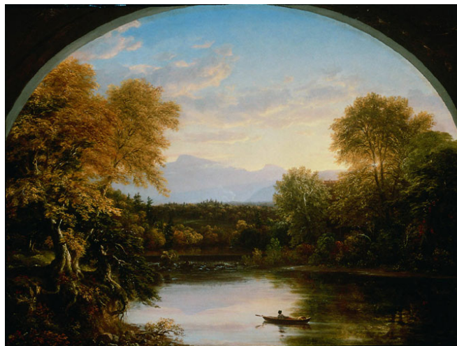
Sunset in the Catskills 1841, Museum of fine Arts, Boston.

in the paintings are all anchored along a stretch of Catskill Creek near the Village of Catskill, where Thomas Cole lived and worked. Part of this waterfront, located less than a mile and a half from the Thomas Cole National Historic Site, has been preserved as a public park by the land conservancy groups Scenic Hudson and Greene Land Trust.