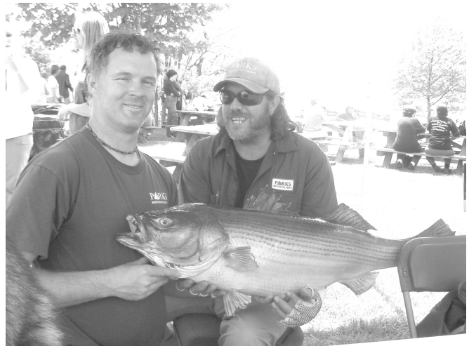
This Nature Center display shad was not caught at the Riverlovers seining event.